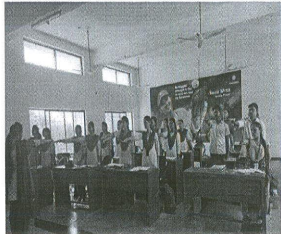
Vignan Institute of Pharmaceutical Technology Latitude:17.711765, Longitude:83.164114