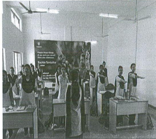
Vignan Institute of Pharmaceutical Technology Latitude:17.711765, Longitude:83.164114