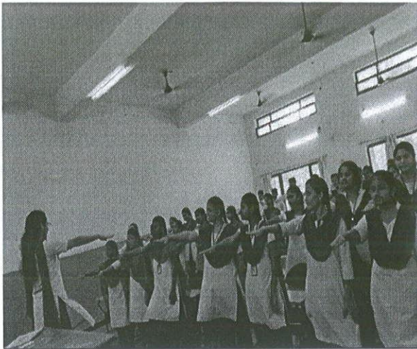
Vignan Institute of Pharmaceutical Technology Latitude:17.711765, Longitude:83.164114