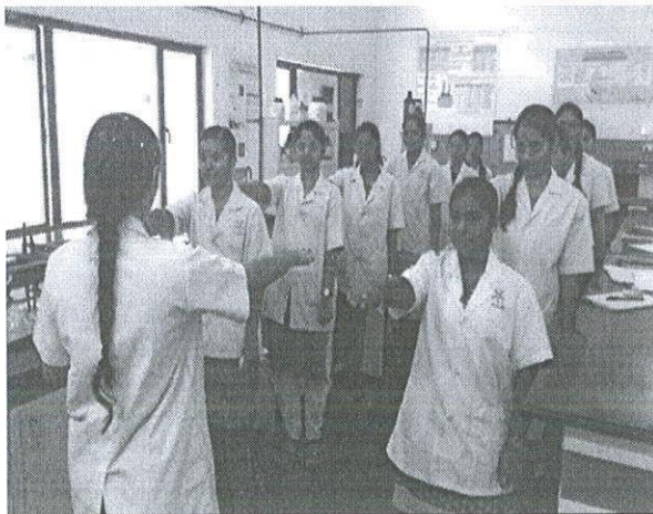
Vignan Institute of Pharmaceutical Technology Latitude:17.711765, Longitude:83.164114