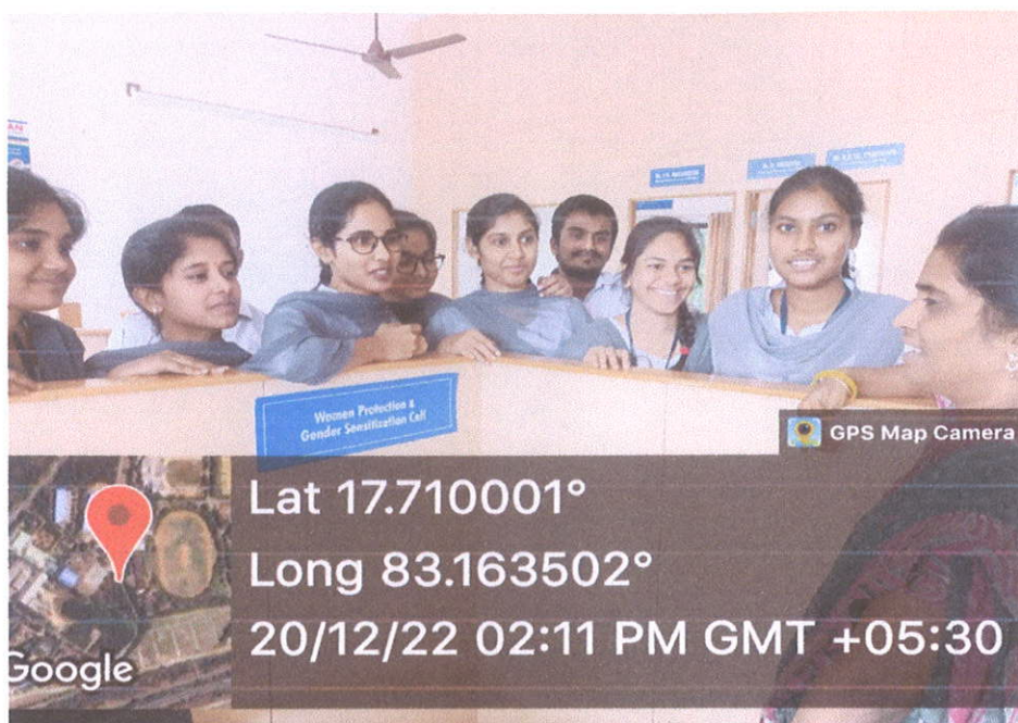
WP&GSC Coordinator Interacting with Students