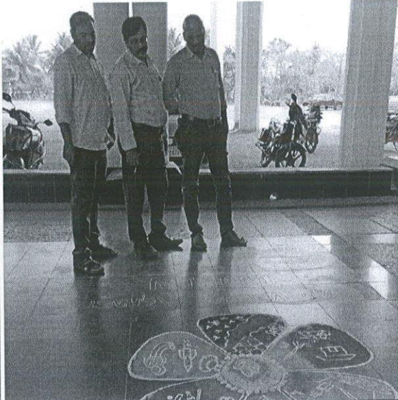
Vignan Institute of Pharmaceutical Technology

Latitude: 17.711765, Longitude: 83.164114 Visakhapatnam, Andhra Pradesh