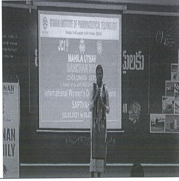
Vignan Institute of Pharmaceutical Technology

Latitude: 17.711765, Longitude: 83.164114 Visakhapatnam, Andhra Pradesh