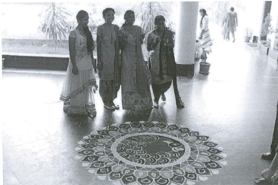
Vignan Institute of Pharmaceutical Technology