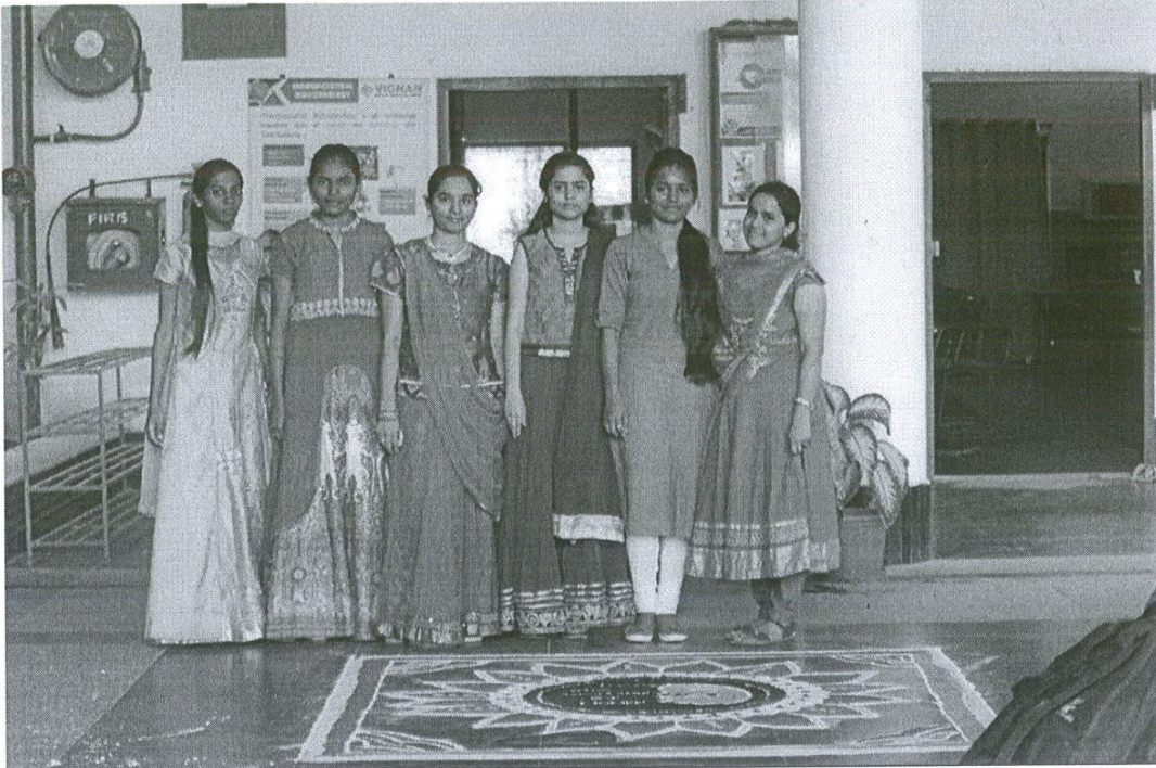
Vignan Institute of Pharmaceutical Technology